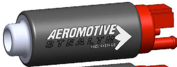
11140- Center Inlet