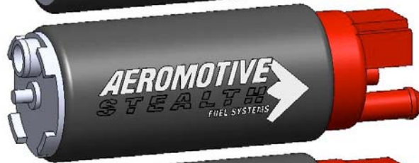
11141- Offset Inlet