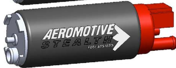
11142 - Inline Inlet